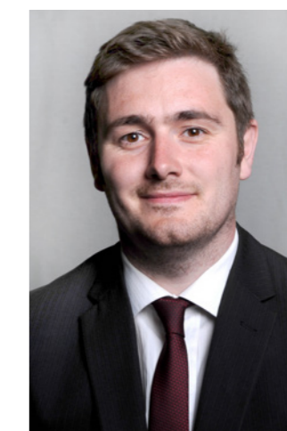
Chris Cooke , Elected Mayor of Middlesbrough